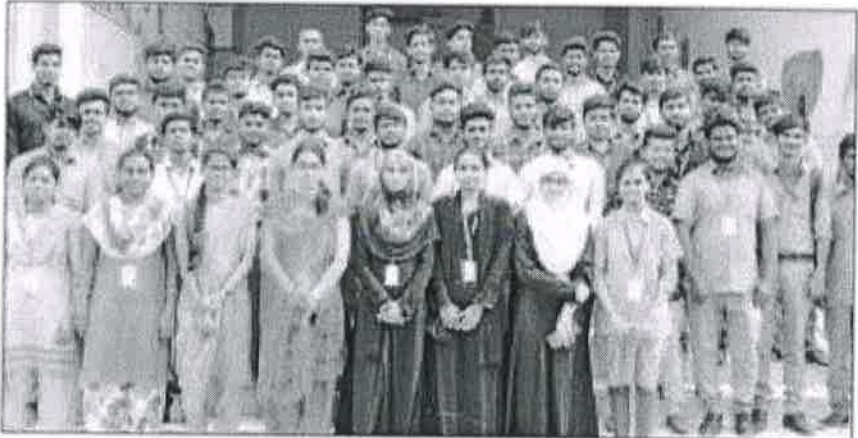
కేంద్ర, రాష్ట్రప్రభుత్వాలు, ఇతర సంస్థల స్కాలర్‌షిప్‌లకు ఎంపికైన మిట్స్ విద్యార్థులు